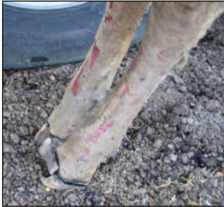
Figure 5. Burned legs of sheep with compromised hoof walls.

burned animal is challenging because the depth/severity of the burn may be difficult to ascertain and the animal may not appear distressed or painful. The burned area may have destroyed the nerve endings and no pain behavior is observed despite severe tissue damage. Vital signs such as heart rate also may be deceptively low. For example, burned sheep from a fire in Zamora, CA in 2006 were walking normally, but their burned legs were without hoof walls which exposed the bone. The animals with burns that are more painful to touch may not be as severely compromised in the long-term. Daily reassessment of all burned animals is necessary.