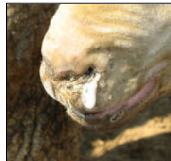
Figure 6. Exudate in nostrils should be removed to assist with breathing.

Approved medications for pain relief in livestock species may be obtained through a licensed veterinarian.